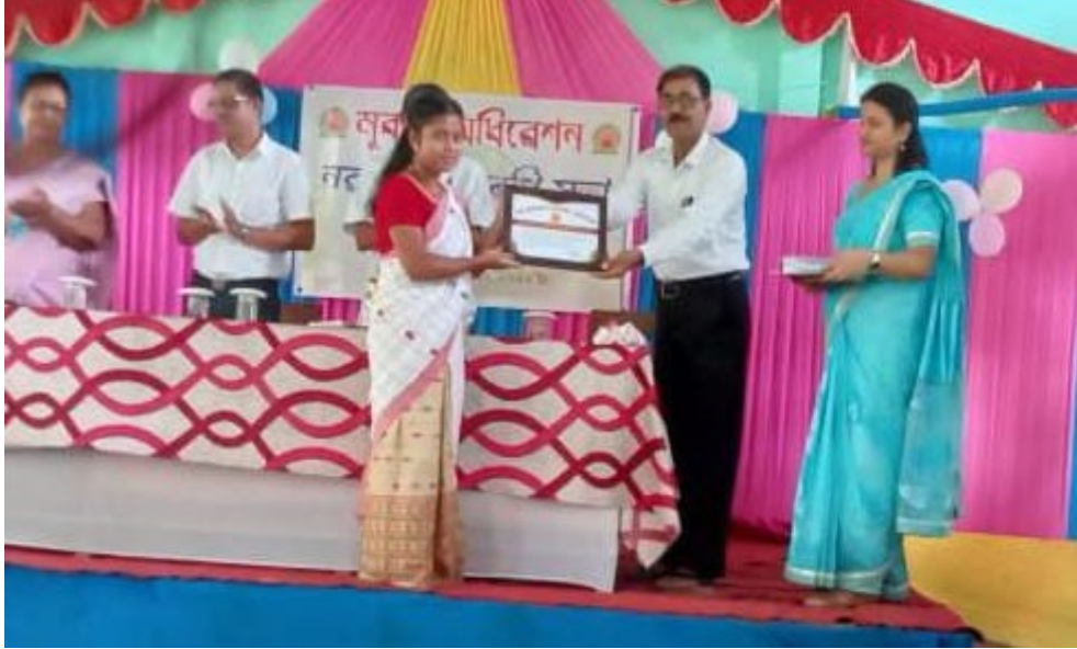
Student taking the Best Reader award