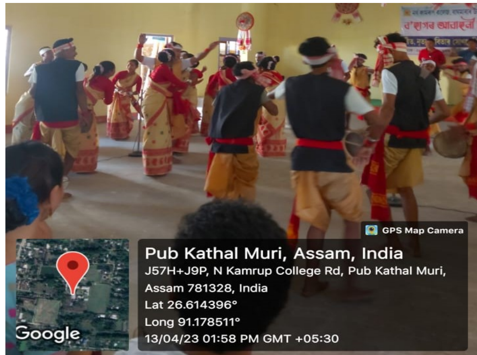
Performance of different communal dance forms.