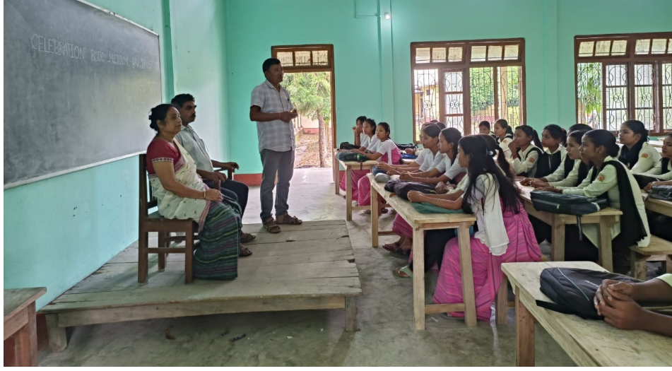
Students wearing community attire as college uniform