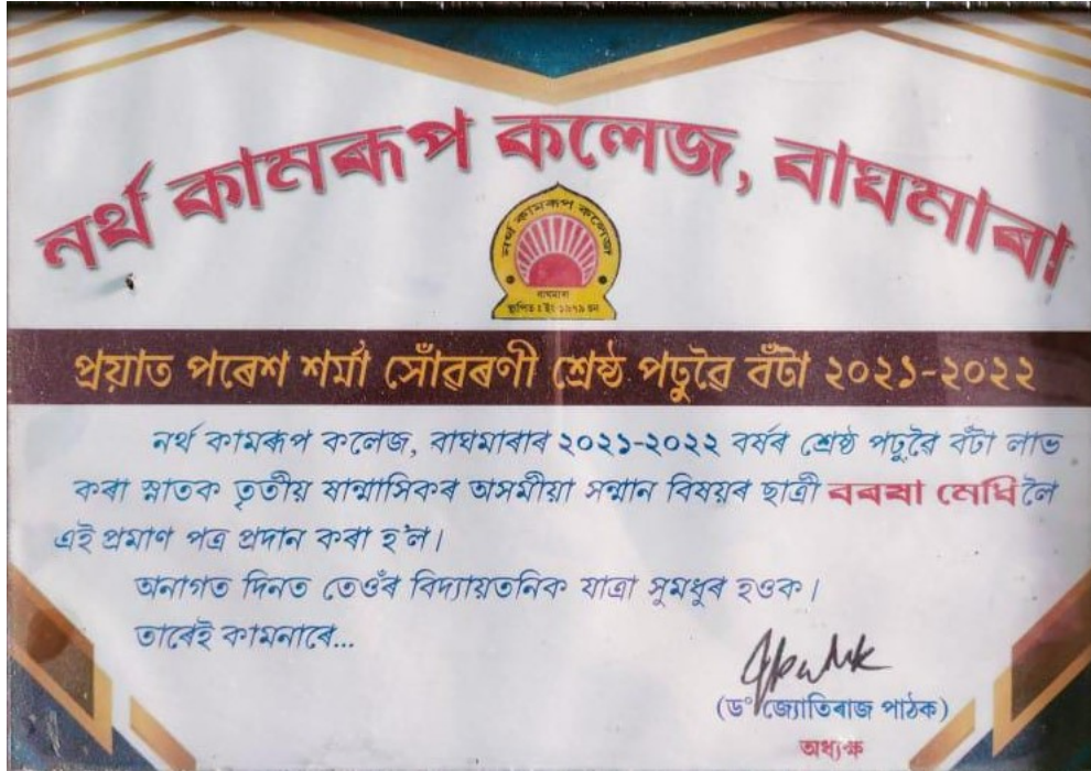
Certificate of Best Reader Award